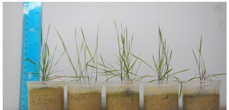
With Seed Pacs